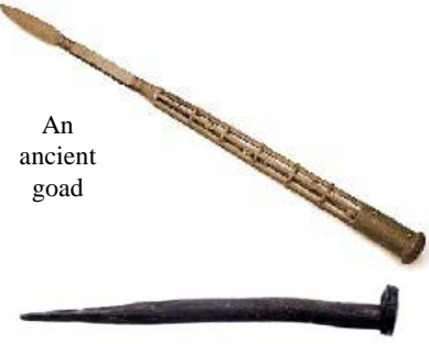
An ancient nail

(Proverbs 14:12) "There is a way that seems right to a man, But its end is the way of death."