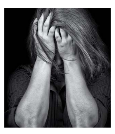
Taken from a booklet "Why Would a Good God Allow Suffering" De Haan

Suffering forces us to evaluate the direction of our lives. We can choose to despair by focusing on our present problems, or we can choose to hope by recognizing God's longrange plan for us (Rom. 5:5; 8:18-28; Heb. 11).