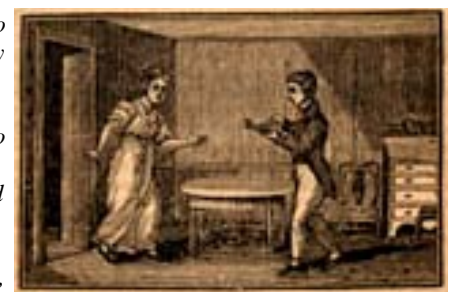
A tract describing the salvation of Abigail Hutchinson

They have forsaken the LORD, They have provoked to anger The Holy One of Israel, They have turned away backward. {5}... You will revolt more and more. The whole head is sick, And the whole heart faints. {6} From the sole of the foot even to the head, There is no soundness in it, But wounds and bruises and putrefying sores; They have not been closed or bound up, Or soothed with ointment. {7} Your country is desolate, Your cities are burned with fire; Strangers devour your land in your presence; And it is desolate, as overthrown by strangers."