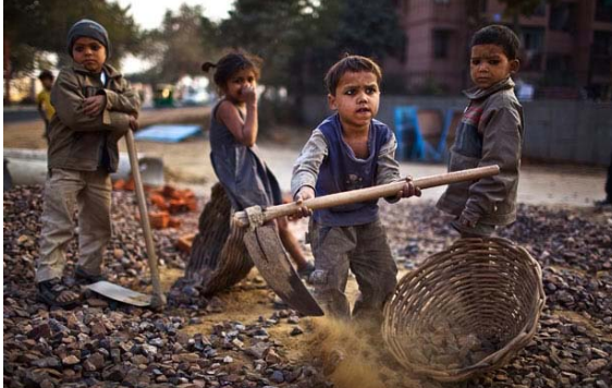
Dalits of India

(John 1:46) ".., "Can anything good come out of Nazareth?" ...""