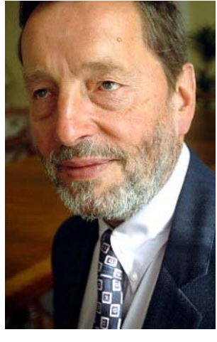
Cynical, bored, sceptical