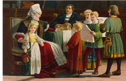
Martin Luther and family

(Proverbs 31:24) She makes linen garments and sells them, ... (Proverbs 31:27-28) She watches over the ways of her household, And does not eat the bread of idleness. [28] Her children rise up and call her blessed; Her husband also, and he praises her: