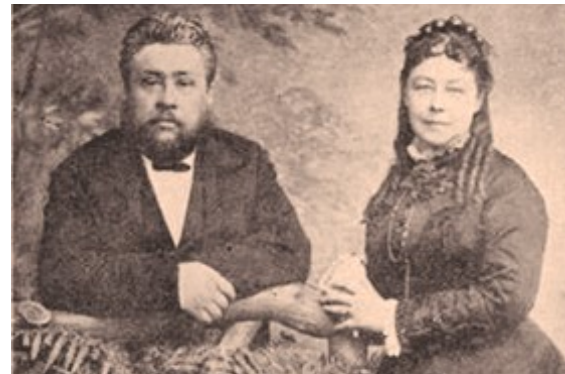
Charles and Susannah Spurgeon

#4. To exercise _____, verses 5, 15 (Luke 2:51) Then He went down with them and came to Nazareth, and was subject to them, ... (Luke 10:17) Then the seventy returned with joy, saying, "Lord, even the demons are subject to us in Your name." (Ephesians 5:22) Wives, submit to your own husbands, as to the Lord. (Ephesians 5:24) Therefore, just as the church is subject to Christ, so let the wives be to their own husbands in everything. (1 Peter 3:1) Wives, likewise, be submissive to your own husbands, that even if some do not obey the word, they, without a word, may be won by the conduct of their wives,