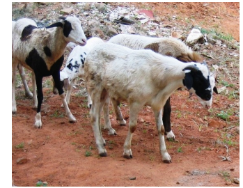
Sheep or Goats

think that they will be heard for their many words.