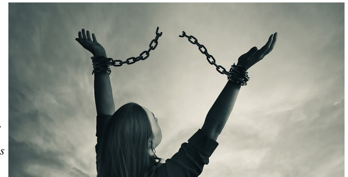
Set free from the fear of man