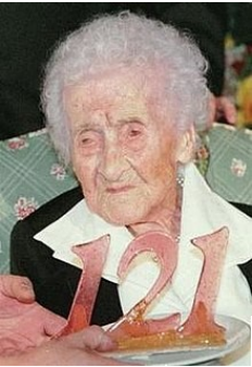
Jeanne Luoise Calment

(Philippians 4:15-17) ... when I departed from Macedonia, no church shared with me concerning giving and receiving but you only. [16] For ... you sent aid once and again for my necessities. [17] Not that I seek the gift, but I seek the fruit that abounds to your account.