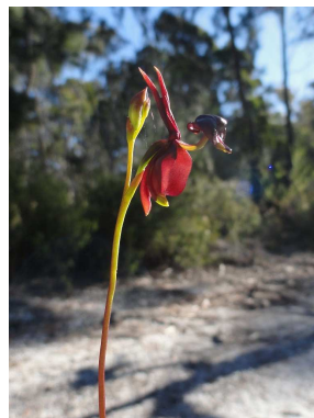
Focus on what matters

(1 Samuel 30:6) Now David was greatly distressed, for the people spoke of stoning him, ... But David strengthened himself in the LORD his God.