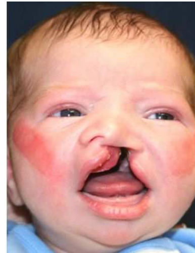
Cleft Lip and palate

2. Bless _____ (who has _____ us), verses 1-2, 20-22