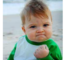
Little King , I

Jeremiah 17:9 "The heart is deceitful above all things, And desperately wicked; Who can know it?"