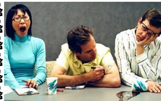
Just bored with evidence

Daniel 2:44-45 And in the days of these kings the God of heaven will set up a kingdom which shall never be destroyed; and the kingdom shall not be left to other people; it shall break in pieces and consume all