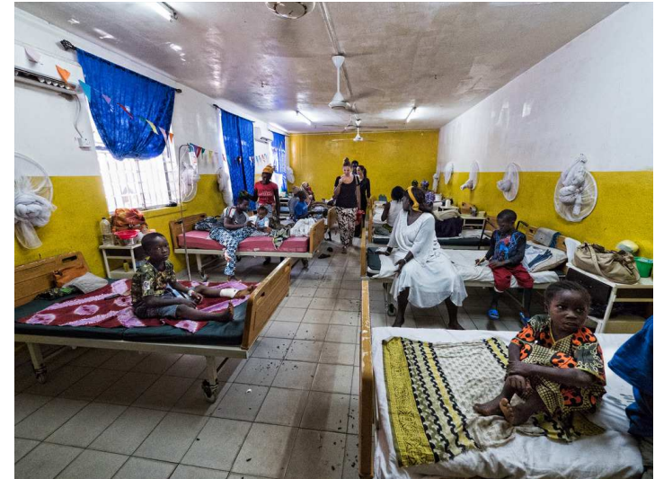
Royal Victoria Hospital, Banjul, The Gambia, West Africa

On the Tuesday before His death, as Jesus leaves the temple, Jesus' disciples ask 4 questions . This results in Jesus longest answer recorded anywhere in the gospels (Matthew 24-25).